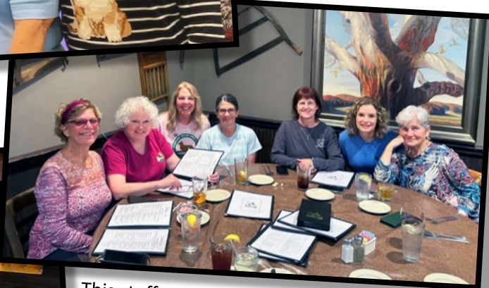
This stuff makes ya hungry (dining with friends)!