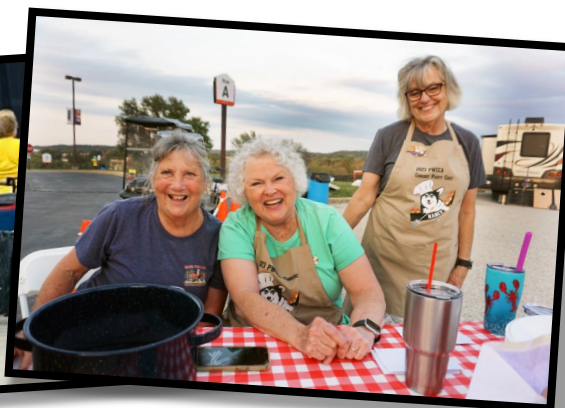
Cook-out in the RV Lot