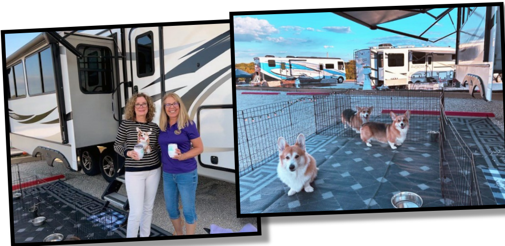
Camping with friends and (canine) family!