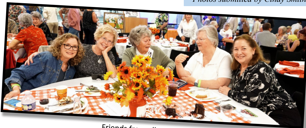
Friends from all over!