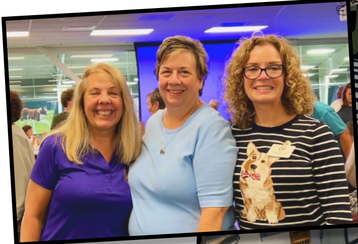
Sunshine members unite!