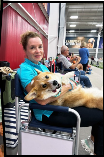
Is it time to run yet?