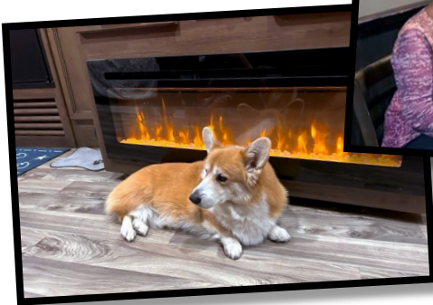
Glamping with my Humins!