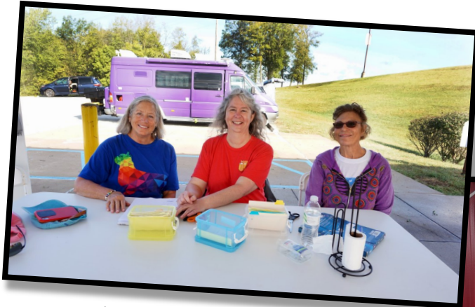
Helping out at FastCAT.