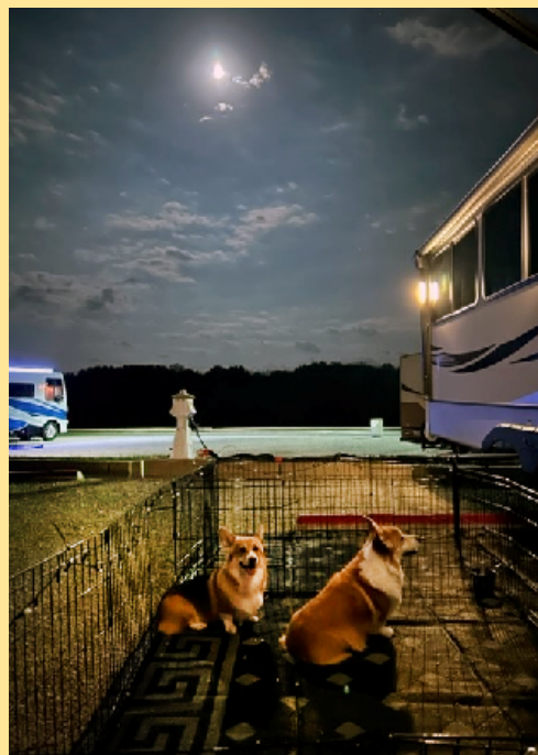
Monlight over Purina Farms