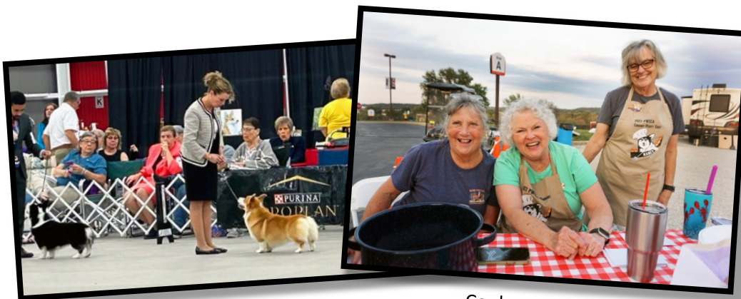
Working in the ring.